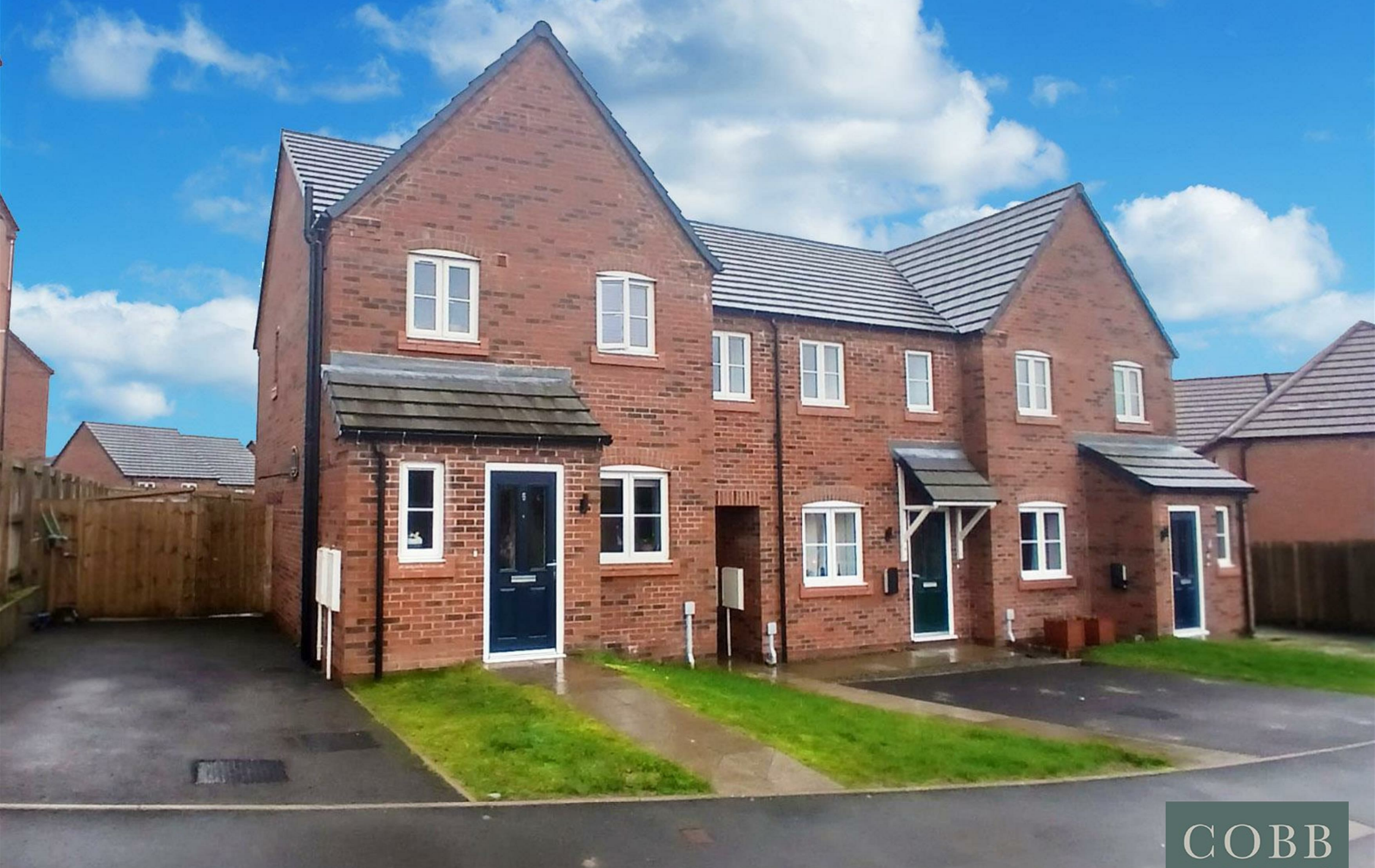
6, Raglan Place, Ludlow, SY8 2LW Price £270,000